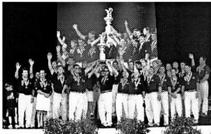
Team New Zealand hold up the America's Cup

The report for the Office of Tourism and Sport showed the cup generated 640 million NZ dollars (319 million US) of economic activity in New Zealand. Auckland got 473 million dollars of it.